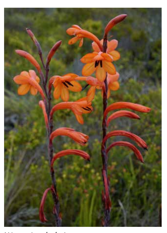
Watsonia tabularis Leucadendron argenteum (left)